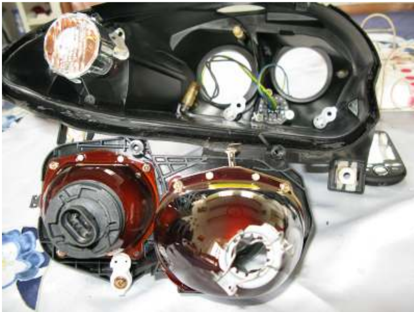
14. Remove these 3 screws from the dipped beam assembly (photo 13).